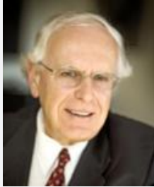
Zdeněk P. Bažant