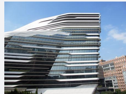
Innovation Tower - Hong Kong Poly U

The 21 technical presentation sessions included 11 special symposia organized by committees and 10 regular sessions. The eleven symposia included two sessions on “Geomaterials: Poromechanics and Failure”, two sessions on “Analytical and Computational modelling of Advanced Materials”, two sessions on “Structural Health Monitoring”, and sessions on “Boundary Element Method and Meshless Method”, “Smart Structures in Hazard Mitigation”, “Fracture Mechanics for Cementitious Materials”, “Soil-Structure Interactions”, and “Forward and Inverse Problems in Elasticity and Applied Mechanics.”